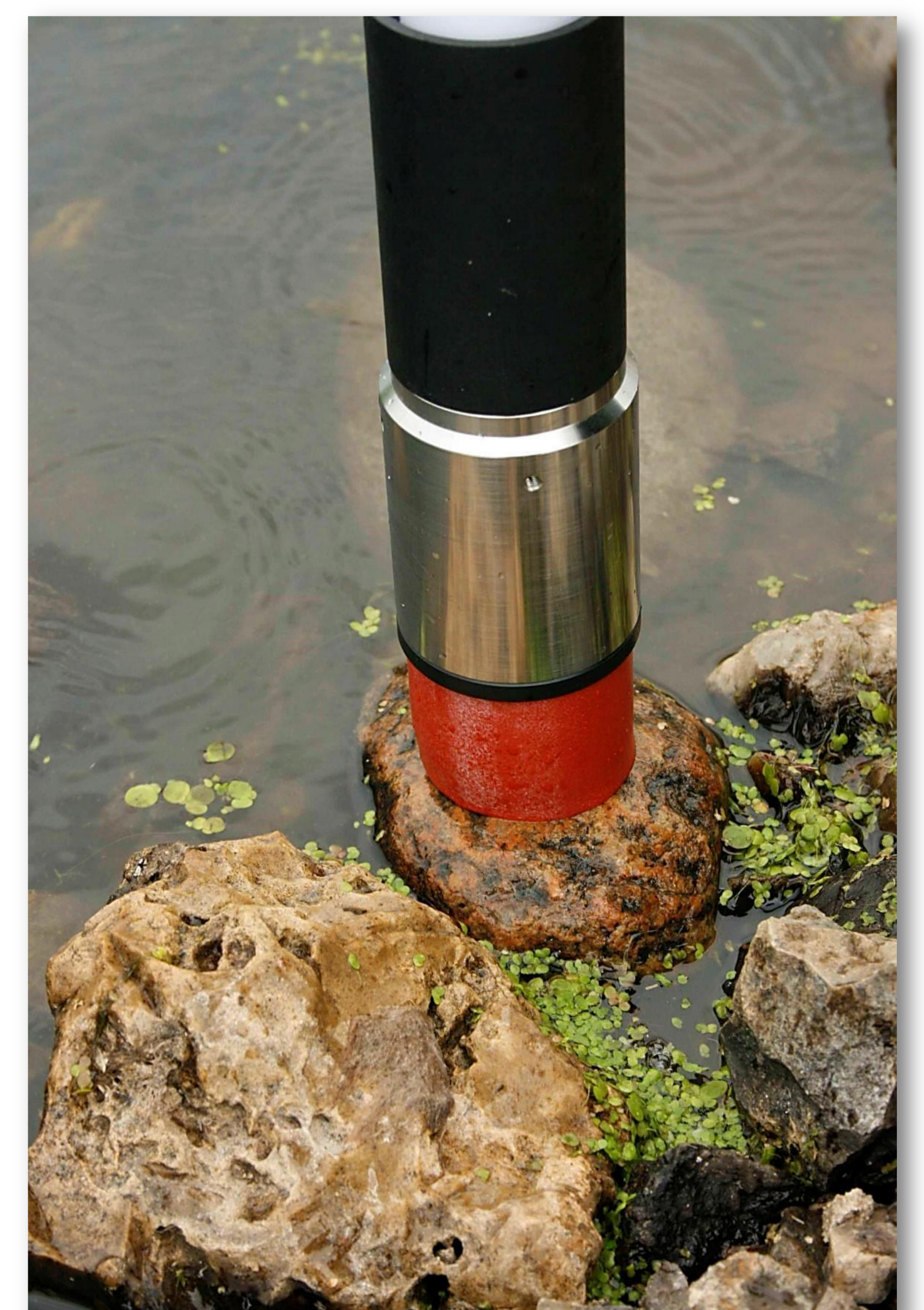
BenthosTorch: For measurement of benthic algae on different substrates