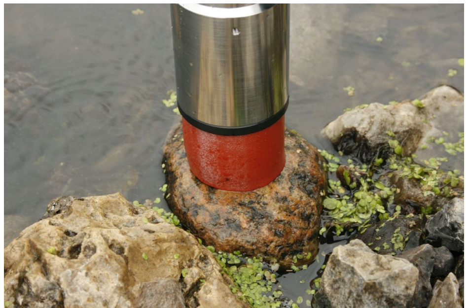
bbe BenthoTorch: for measurement of benthic algae on different substrates

Traditional methods include sampling of benthic algae by scraping surface materials or rapid deep-freezing and subsequent chlorophyll extraction. However, these methods cannot determine different algal groups. Alternatively, the use of time-consuming microscopy is limited to accessible objects rarely found in the field.