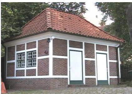
Measuring station in Hamburg

Different patterns of fluorescence excitation reflect the photosynthetic efficiency of the algae. The fluorescence