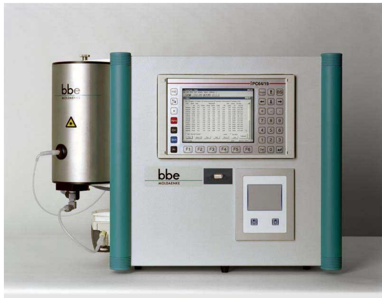
Algae Online Analyser with sensor (left), sample pump (left), IP 54 housing, industrial PC, touch pad, USB socket for memory stick

signals f_0 , f , f_m are used to calculate the Genty-Parameter as the most accepted measure for the algae activity. The activity is closely related to the oxygen evolution.