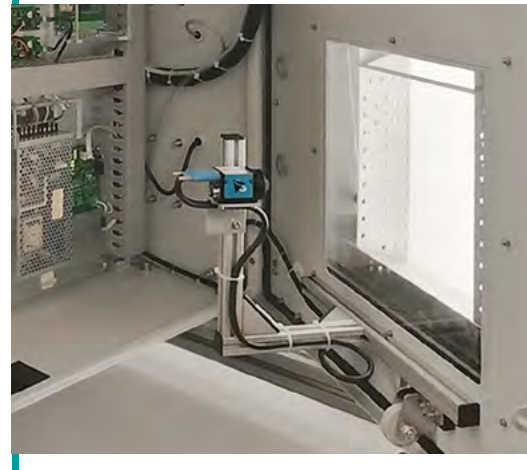
The behavior of the fish is permanently monitored with a USR camera