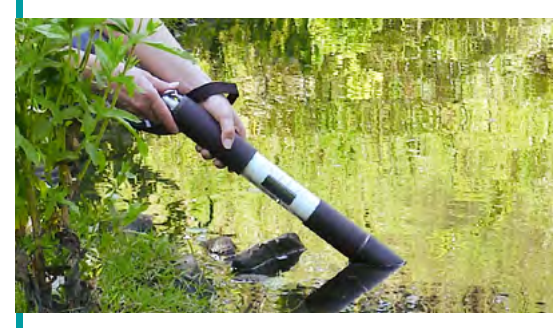
AlgaeTorch measurement on site.