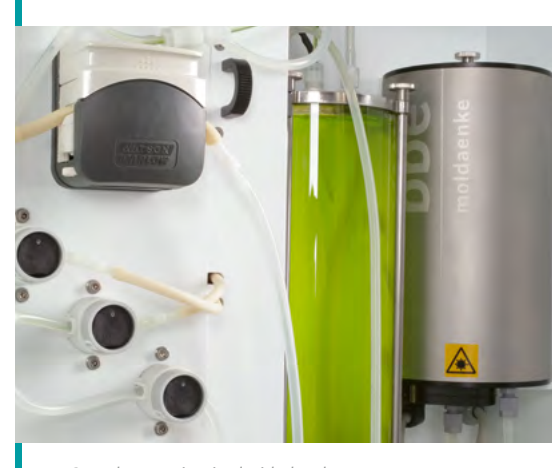
Sample water is mixed with the algae test solution and then analysed.