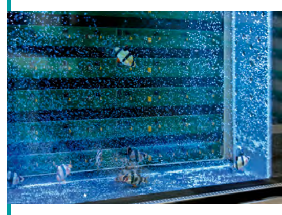
The ToxProtect II monitors the swimming activity of fish in an aquarium fed with drinking or mains water