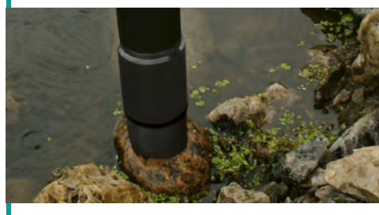
The BenthoTorch used to measure algal classes and their concentration on a stone surface.