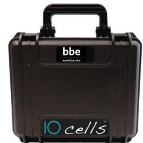
The 10cells comes in a robust case, perfect for the onboard operations