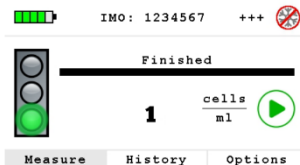
PDF report and screenshot of results