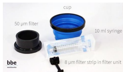
Accessories for the preparation of the measurement