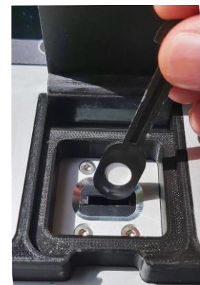
Filter strip with sample water is analysed within just a few seconds