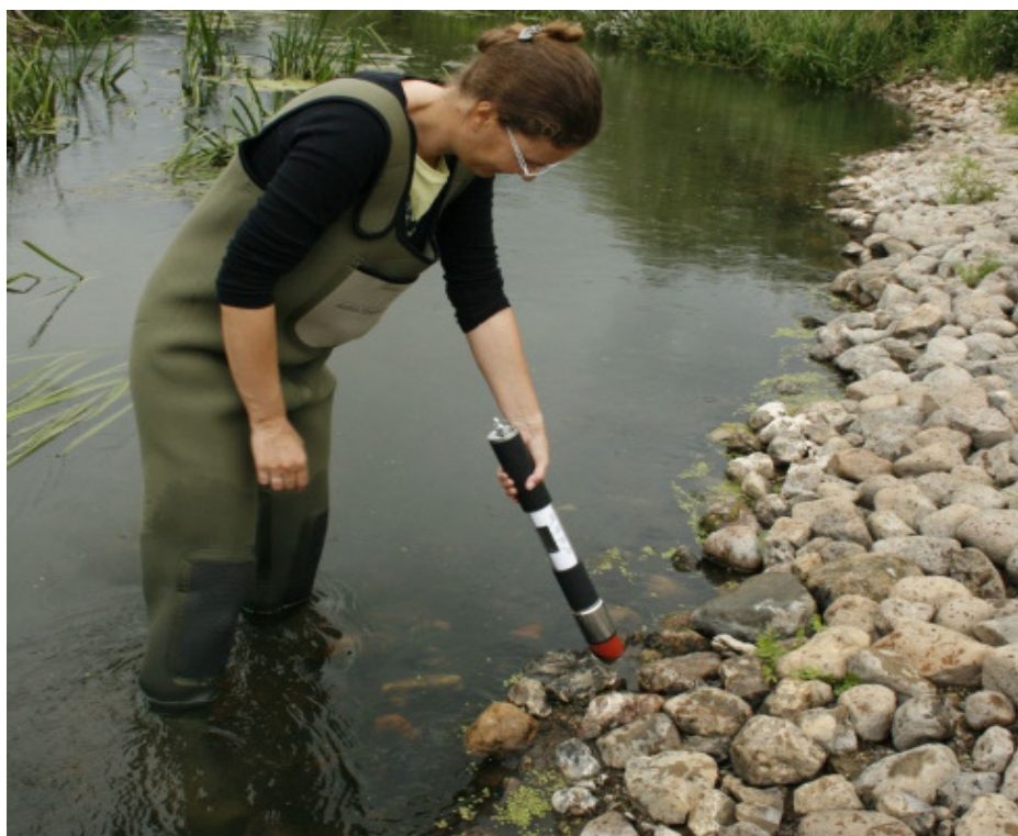
BenthoTorch used in the AQUAREHAB project in Denmark and Belgium