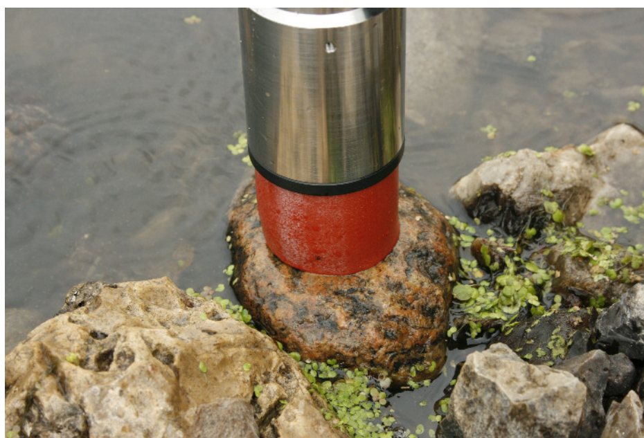
bbe BenthoTorch: for measurement of benthic algae on different substrates

Traditional methods include sampling of benthic algae by scraping surface materials or rapid deep-freezing and subsequent chlorophyll extraction. However, these methods cannot determine different algal groups. Alternatively, the use of time-consuming microscopy is limited to accessible objects rarely found in the field.